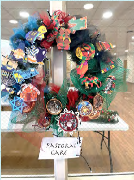
1 st Place Pastoral Care