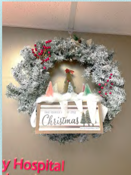
1 st Place Patient Access