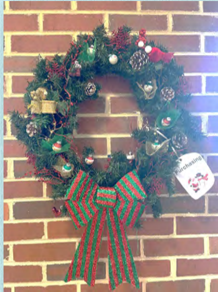
2 nd Place Purchasing