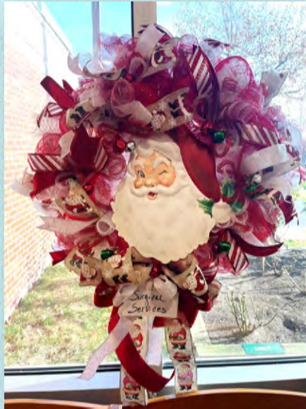
1 st Place Surgical Services