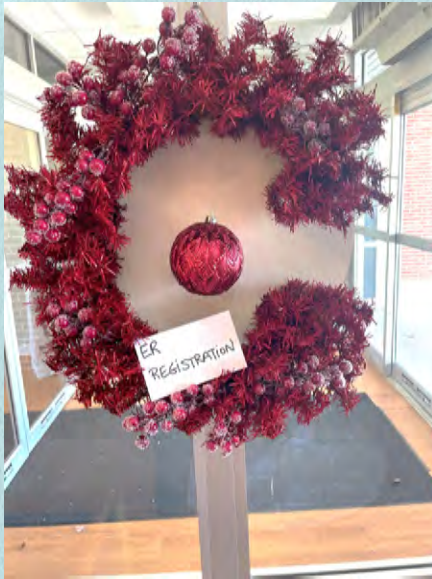
1 st Place ER Registration