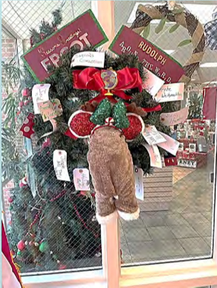
1 st Place Financial Counseling