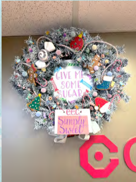
1 st Place Early Education Center