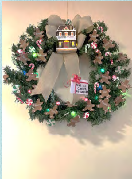
2 nd Place AMI @ Cooper/Rio