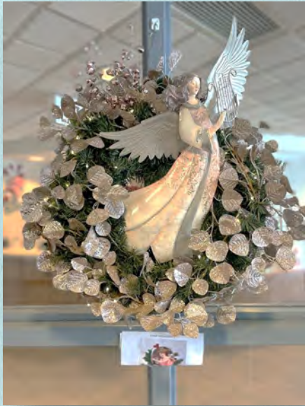
1 st Place Care Management