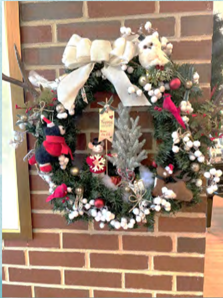
1 st Place Emergency Department