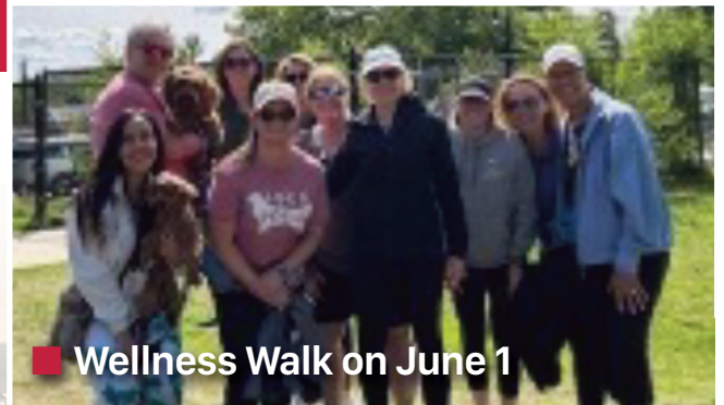
■ Wellness Walk on June 1